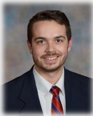
Justin Bright Architecture

Our Chapter thanks you all for all you have done these past years. We wish you the best of luck in all your future endeavors. Be sure to come back and visit us, as our door continues to remain open to you all.