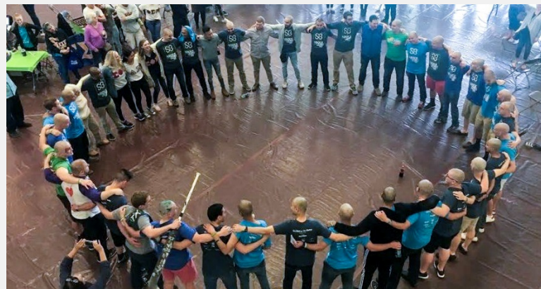
St. Baldrick's Head Shaving