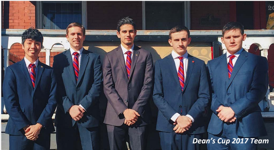
Dean's Cup 2017 Team